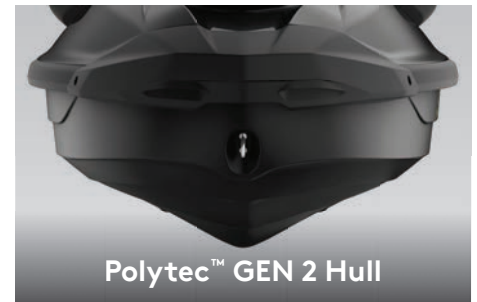
Polytec™ GEN 2 Hull

This exclusive Sea-Doo® feature optimizes power output for up to 46% improved fuel efficiency. 1