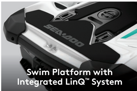
Swim Platform with Integrated LinQ™ System

An impressive 152 liters of sealed storage space allows riders to safely stow belongings while riding.