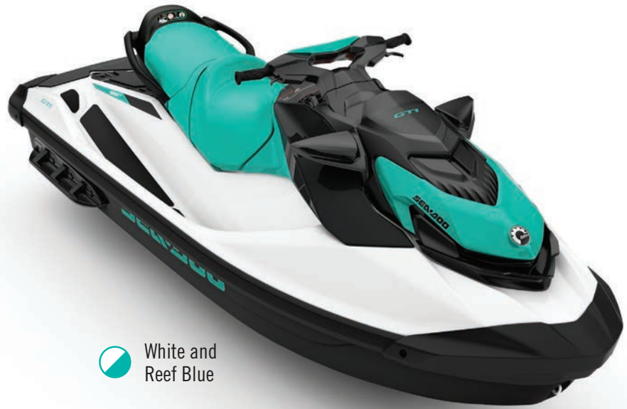
White and Reef Blue