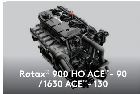
Rotax® 900 HO ACE™ - 90 /1630 ACE™ - 130

Exclusive to Sea-Doo®, iBR® stops the watercraft sooner and provides more control and maneuverability at low speeds and in reverse.