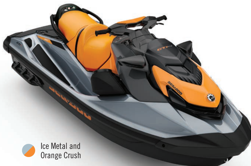
Ice Metal and Orange Crush