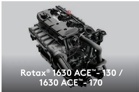
Rotax® 1630 ACE™ - 130 / 1630 ACE™ - 170

The new Rotax 1630 HO ACE engine is the most powerful naturally aspirated Rotax engine ever on a Sea-Doo watercraft.