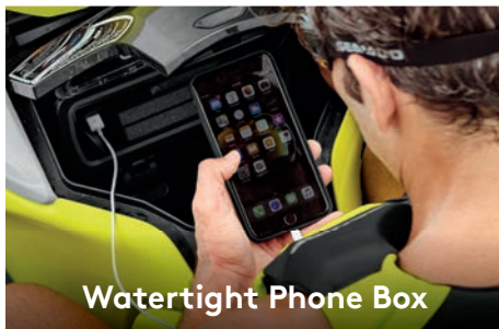
Watertight Phone Box

Makes boarding from the water easier and quicker.