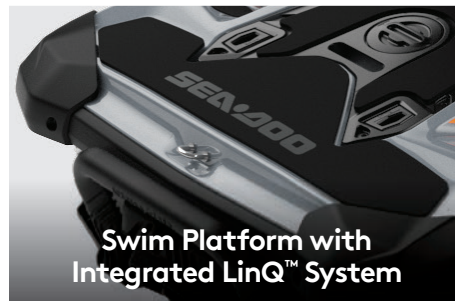
Swim Platform with Integrated LinQ™ System

Waterproof and shockproof compartment specifically designed for phone protection.