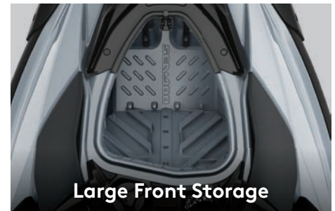
Large Front Storage

Exclusive quick-attach system on a large swim platform that allows for easy installation of accessories.