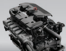
Rotax® 1630 ACE Supercharged™ - 230 Engine 1

This powerful engine comes standard with a supercharger and external intercooler. It is optimized to run on 95 octane fuel, which lowers fuel costs.