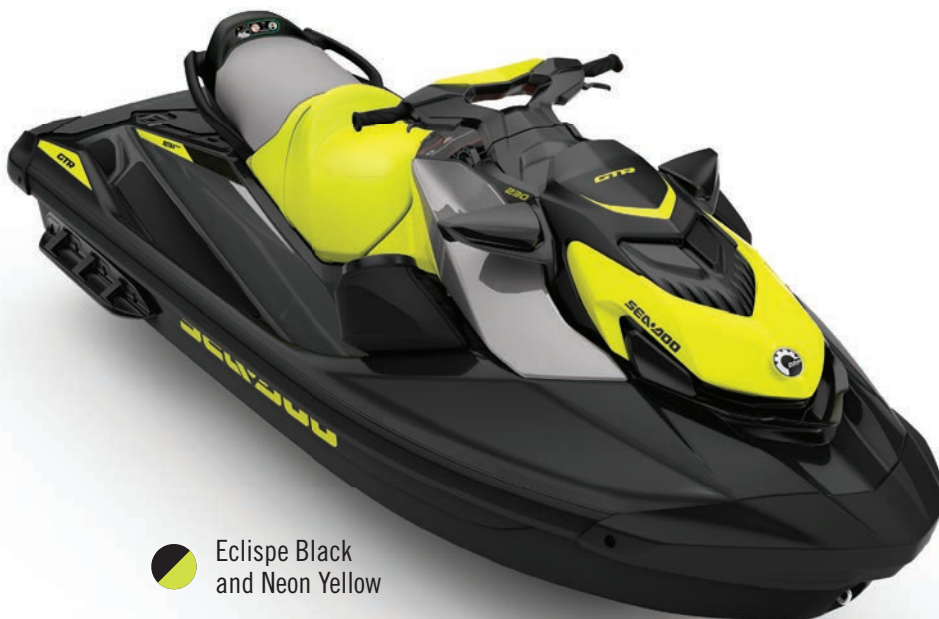
Eclipse Black and Neon Yellow