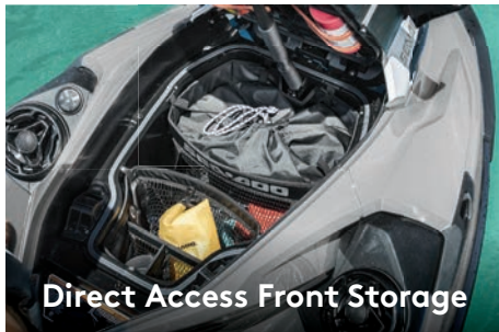
Direct Access Front Storage

Large front storage area that's easily accessible from a seated position. 1 Storage bin organizer included for ultimate convenience.