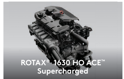
ROTAX® 1630 HO ACE™ Supercharged

Waterproof and shockproof compartment specifically designed for phone protection. 2