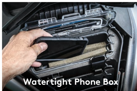
Watertight Phone Box

An innovative hull that sets the benchmark for rough water handling, stability, and offshore performance.