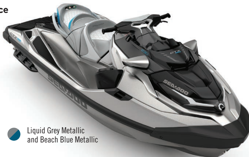
Liquid Grey Metallic and Beach Blue Metallic