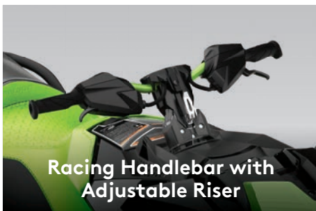
Racing Handlebar with Adjustable Riser

A narrow seat profile with deep knee pockets lets riders sit naturally and use the leg muscles to hold onto the machine for more control.