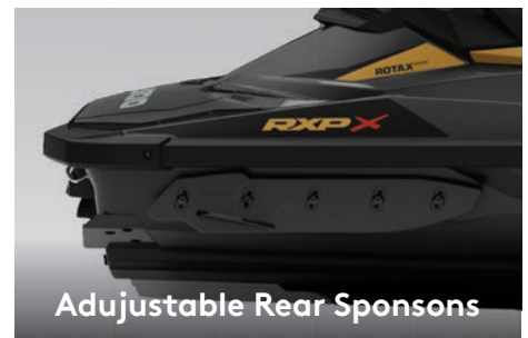
Adjustable Rear Sponsons

Limits bow rise and improves performance in all water conditions.