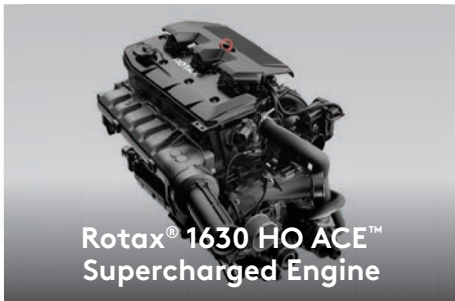
Rotax® 1630 HO ACE™ Supercharged Engine

The Rotax® 1630 HO ACE™ Supercharged is the most powerful Rotax® engine ever, delivering high efficiency and the best-in-class acceleration.