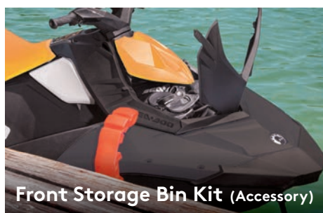
Front Storage Bin Kit (Accessory)

Two fuel efficient, compact and lightweight Rotax® engine options.