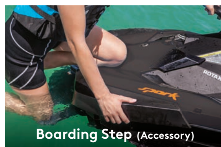
Boarding Step (Accessory)

Designed to improve freedom of movement while riding.