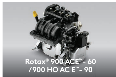
Rotax® 900 ACE™ - 60 /900 HO AC E™ - 90

This innovative composite plastic is robust and more scratch-resistant than fiberglass. Plus, it's weight savings help to deliver impressive performance and efficiency.