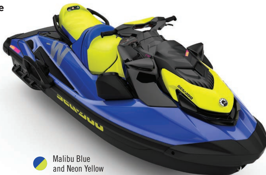
Malibu Blue and Neon Yellow