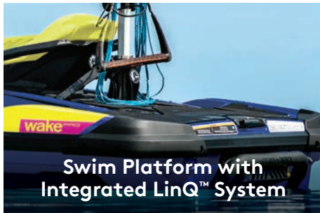
Swim Platform with Integrated LinQ™ System

Exclusive quick-attach system on the largest swim platform in the industry that allows for easy installation of accessories. 1