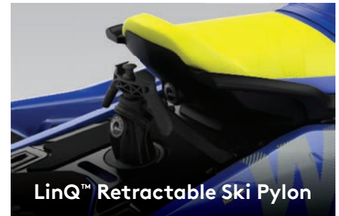
LinQ™ Retractable Ski Pylon

The industry-first manufacturer-installed, truly waterproof, Bluetooth ® audio system. 2